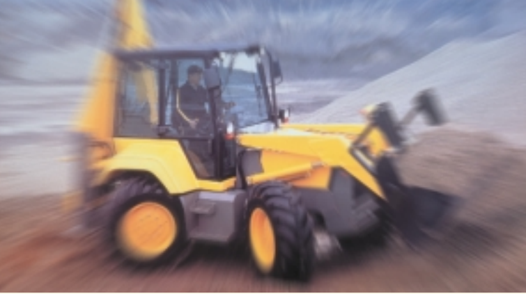
Four wheel steering