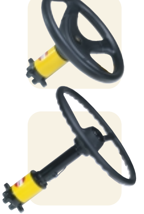
OSPM steering unit with steering wheel